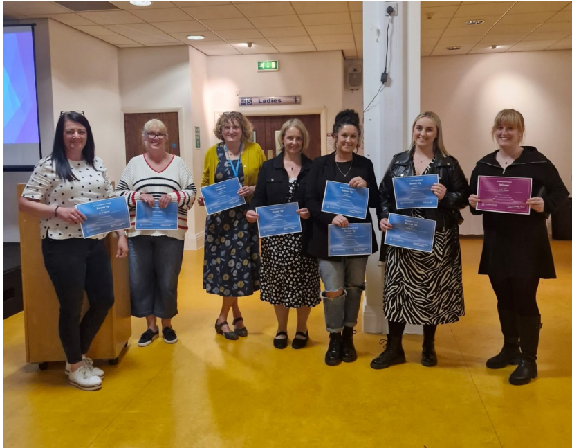
Some of our award winners and runners up!