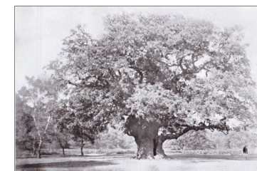
The Major Oak in 1903

Physical Inactivity—Ollerton Children’s Centre